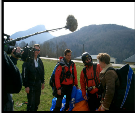
Filming at Chamonix with Discovery Channel